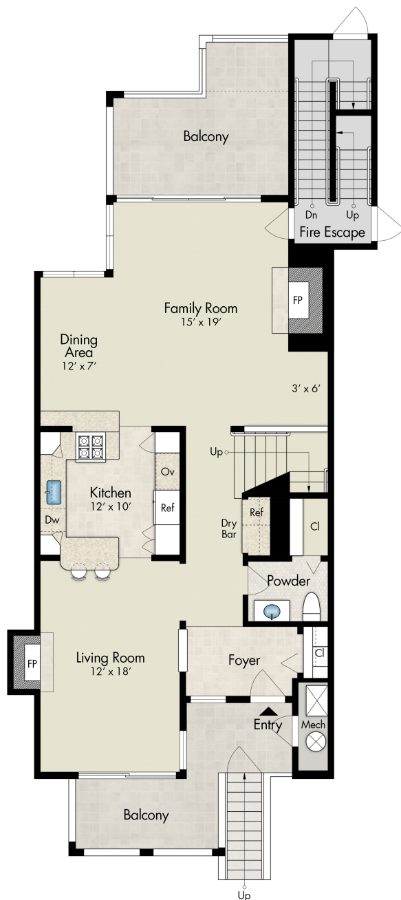
Main Level 1,101 SQ FT Plus Mech Room: 26 SQ FT