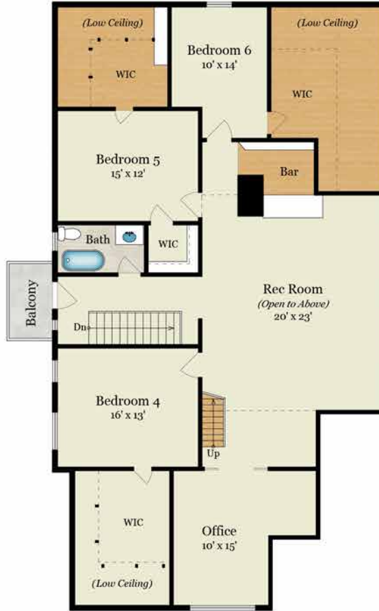
MAIN RESIDENCE THIRD FLOOR 1,830 SQ FT - Finished 315 SQ FT - Low Ceiling