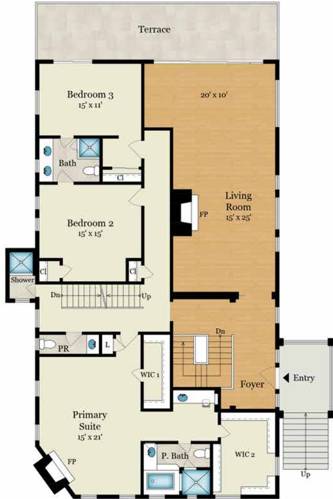
MAIN RESIDENCE SECOND FLOOR 2,380 SQ FT