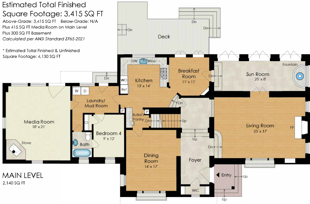
MAIN LEVEL 2,140 SQ FT

* Estimated Total Finished & Unfinished Square Footage: 4,130 SQ FT