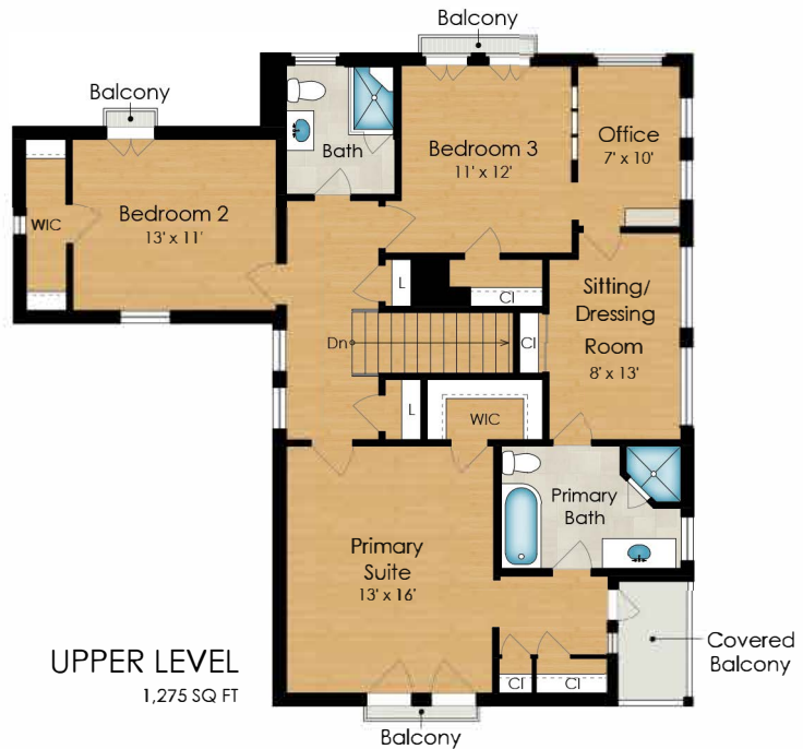
UPPER LEVEL 1,275 SQ FT