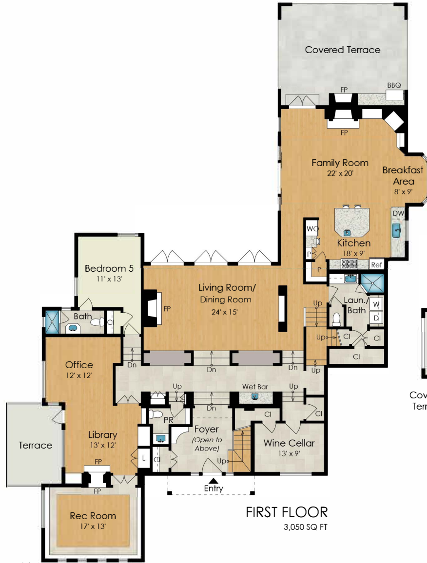
FIRST FLOOR 3,050 SQ FT

Estimated Total Finished Square Footage: 4,890 SQ FT Above-Grade: 1,840 SQ FT Below-Grade: 3,050 SQ FT Plus 565 SQ FT 3-Car Garage (Second Floor) Plus 65 SQ FT Storage (Second Floor) Calculated per ANSI Standard Z765-2021.