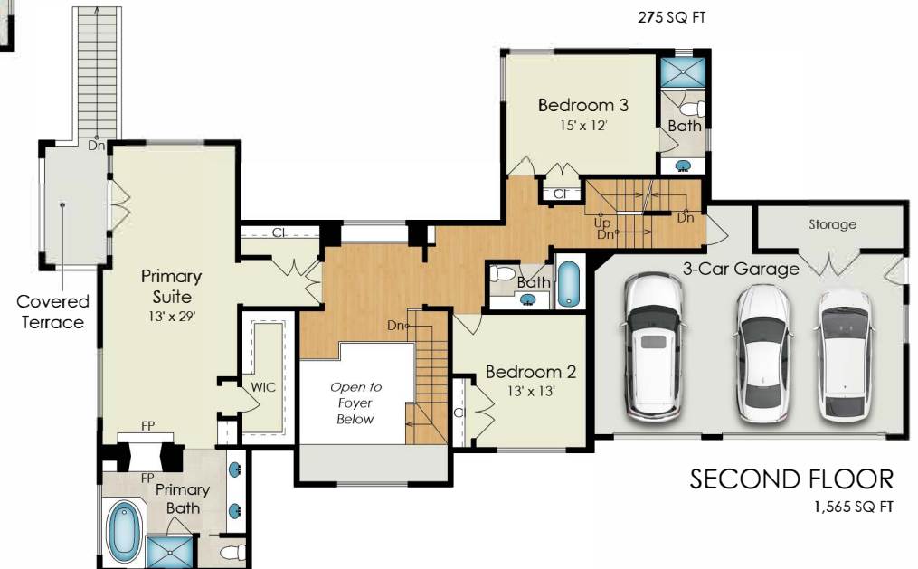
SECOND FLOOR 1,565 SQ FT