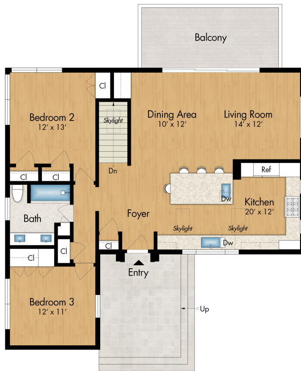
Main Level 1,317 SQ FT

Calculated per ANSI Standard Z765-2003 Estimated Total Finished and Unfinished Square Footage: 2,425 SQ FT