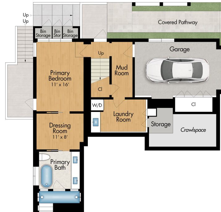
Lower Level 747 SQ FT Plus Garage: 331 SQ FT Plus Storage: 30 SQ FT