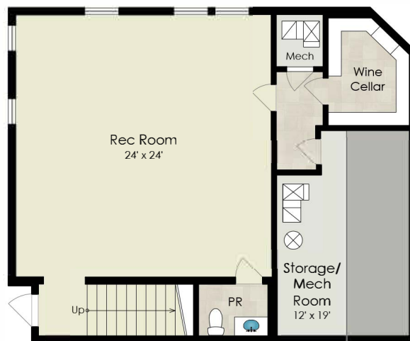
LOWER LEVEL 875 SQ FT