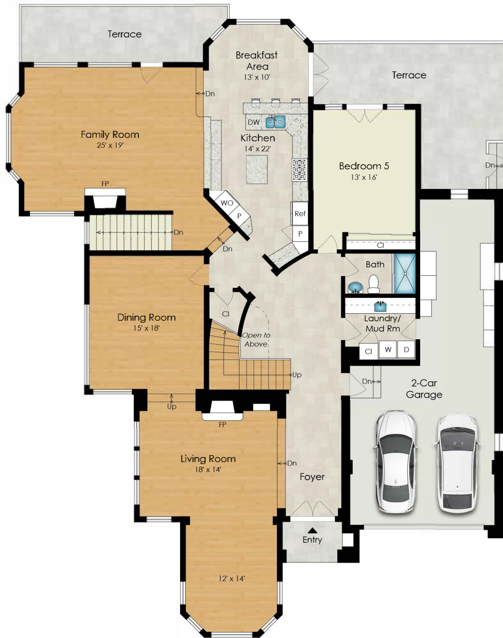
MAIN LEVEL 2,690 SQ FT

* Estimated Total Finished & Unfinished Square Footage: 6,625 SQ FT