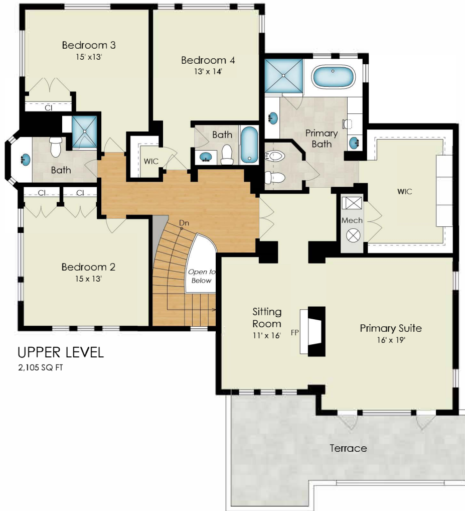
UPPER LEVEL 2,105 SQ FT