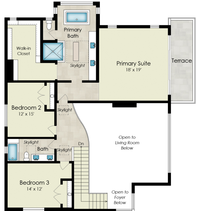
UPPER LEVEL 1,645 SQ FT

Estimated Total Finished Square Footage: 4,455 SQ FT