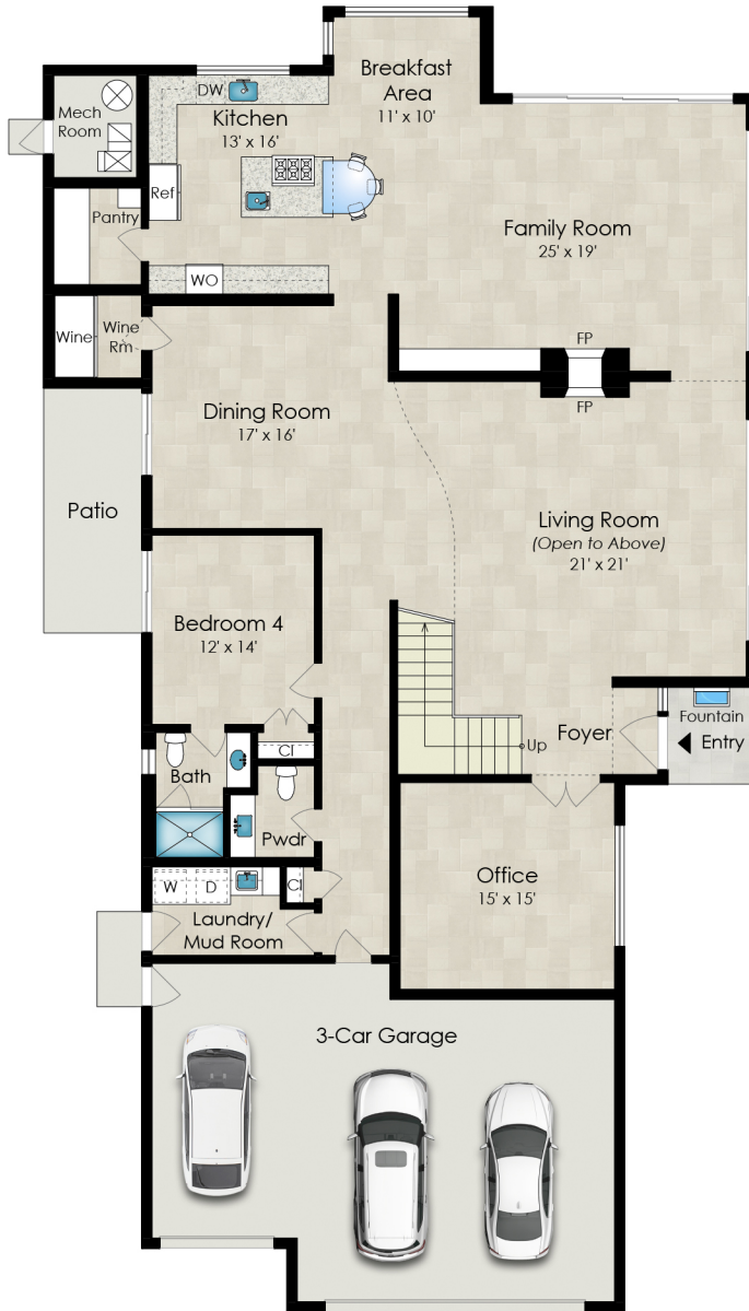
MAIN LEVEL 2,810 SQ FT