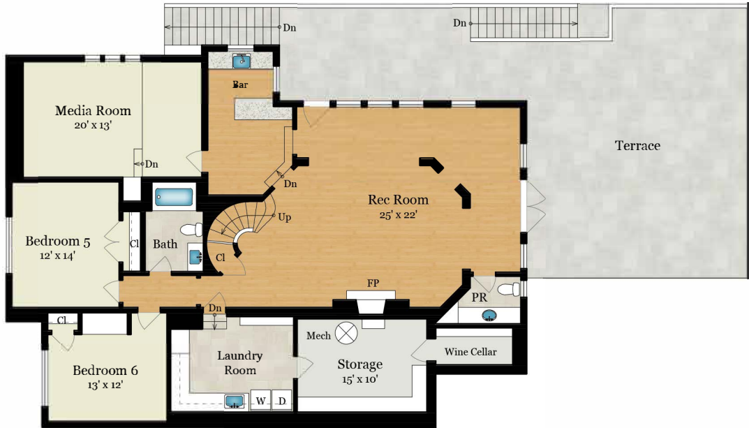
LOWER LEVEL 1,940 SQ FT