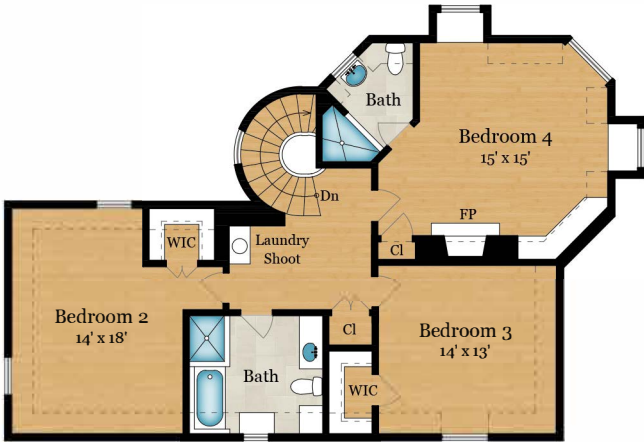
UPPER LEVEL 945 SQ FT