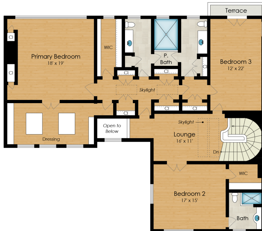
UPPER LEVEL 2,370 SQ FT