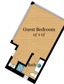
GUEST SUITE (BELOW GARAGE) 315 SQ FT