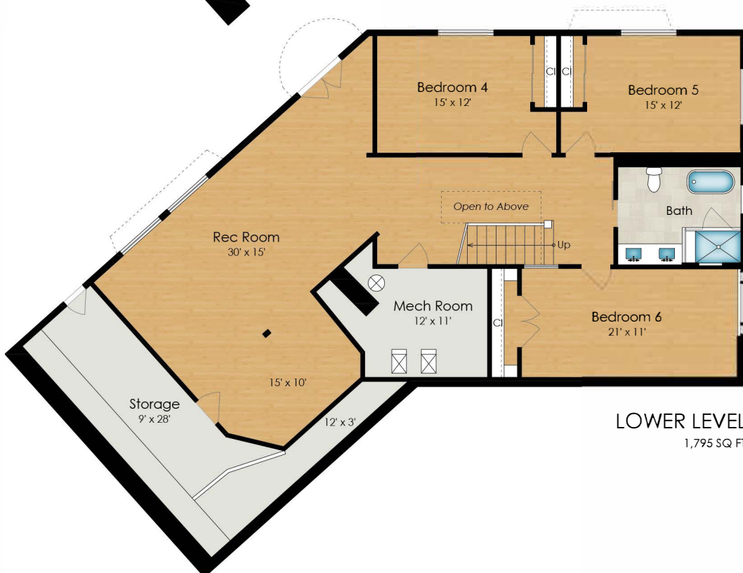
LOWER LEVEL 1,795 SQ FT