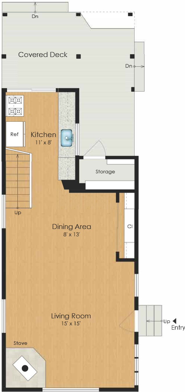
MAIN LEVEL 500 SQ FT