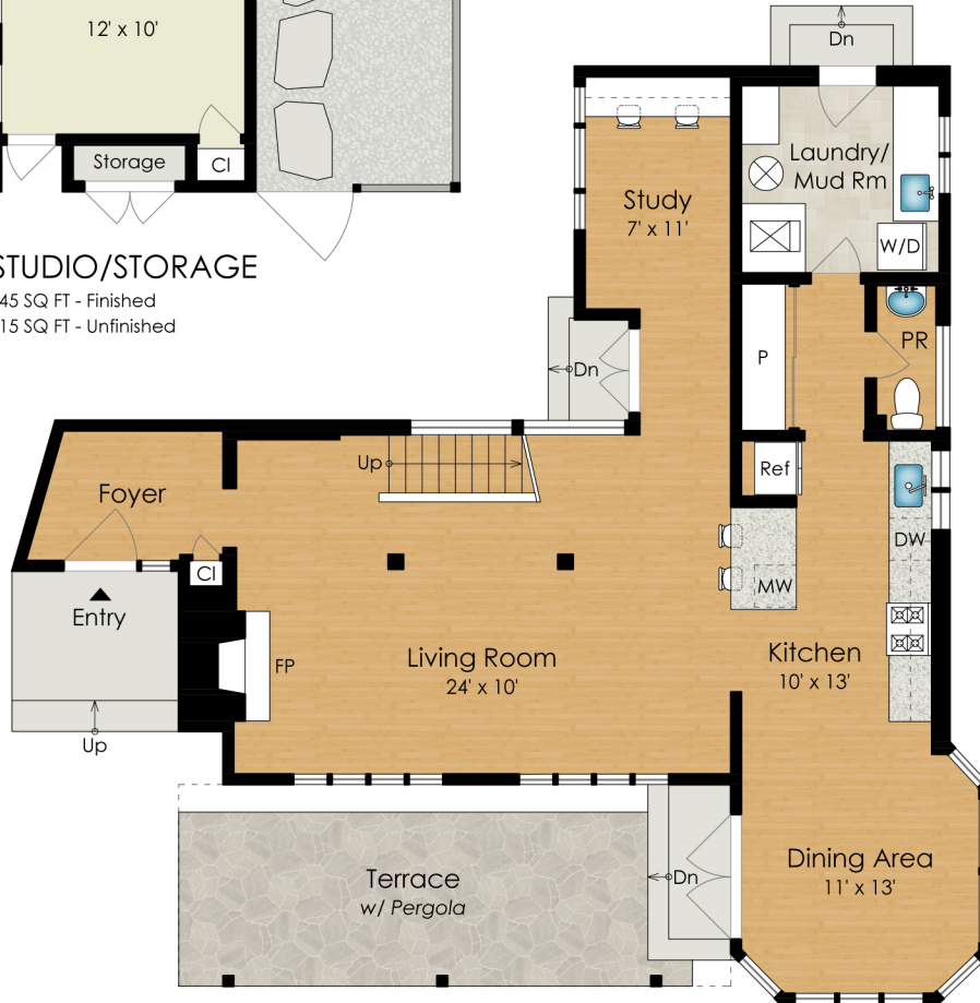
MAIN RESIDENCE MAIN LEVEL 1,100 SQ FT

* Estimated Total Finished & Unfinished Square Footage: 2,240 SQ FT