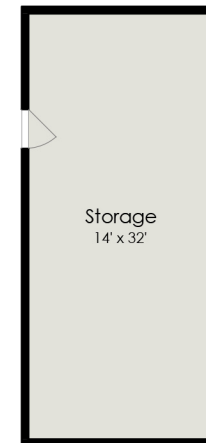
SHED (BELOW TERRACE W/ FP) 470 SQ FT