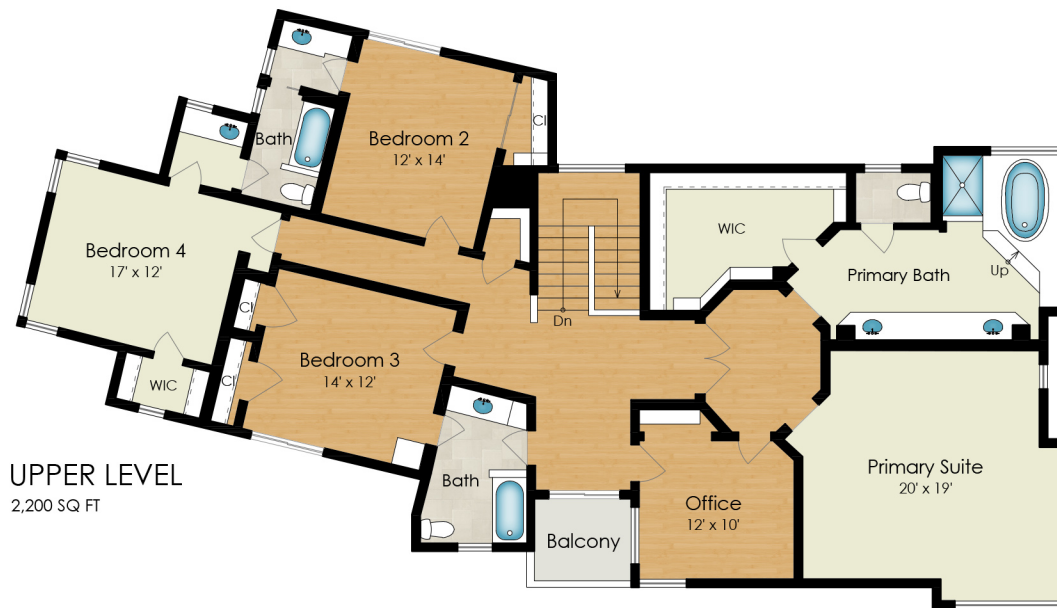
UPPER LEVEL 2,200 SQ FT