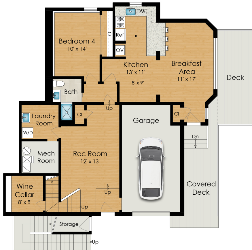
MAIN RESIDENCE LOWER LEVEL (ADU) 1,235 SQ FT

* Estimated Total Finished & Unfinished Square Footage: 4,535 SQ FT