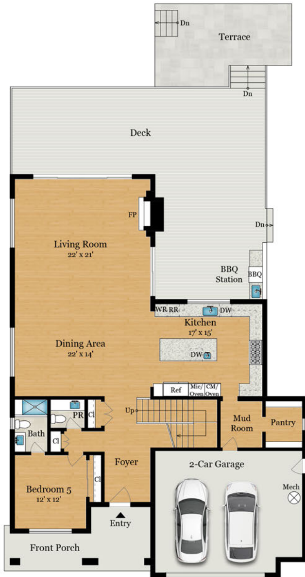
MAIN LEVEL 1,785 SQ FT

* Estimated Total Finished & Unfinished Square Footage: 4,085 SQ FT