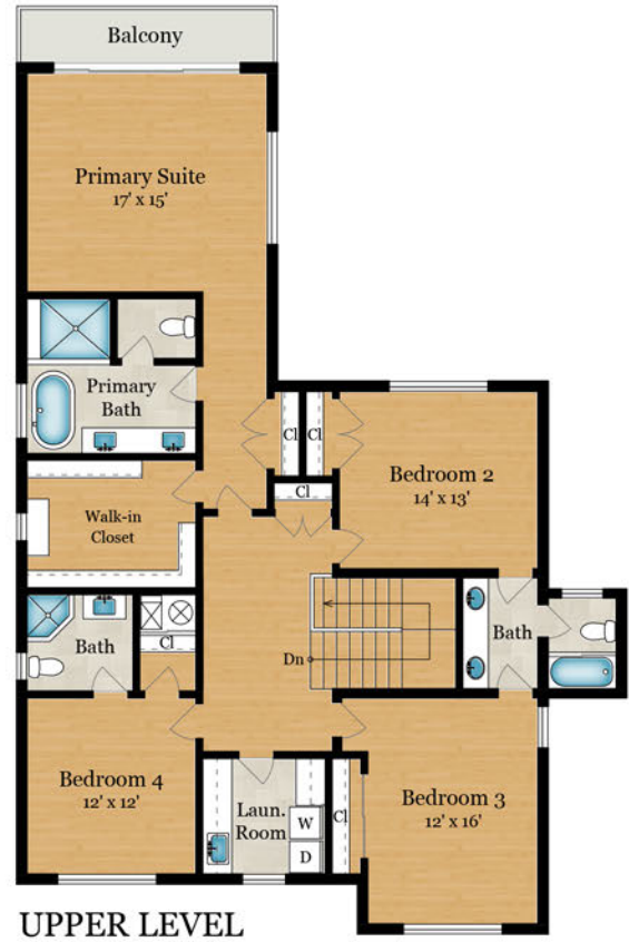
UPPER LEVEL 1,810 SQ FT