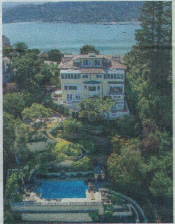
VIA CITY OF BELVEDERE

As the owners of a historic property, the DuMolins are now eligible to apply for a tax break under the Mills Act, a locally-controlled tax-abatement program through the state to incentivize the preservation and restoration of historic homes. Under the program, property taxes are substantially reduced for a minimum of 10 years.