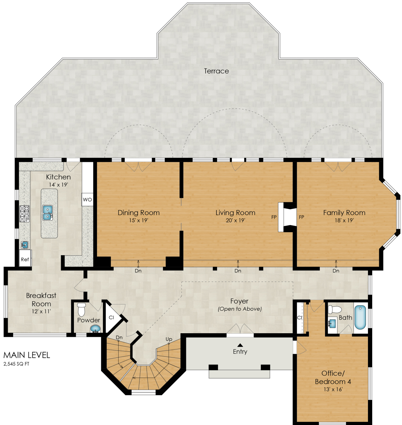
MAIN LEVEL 2,545 SQ FT