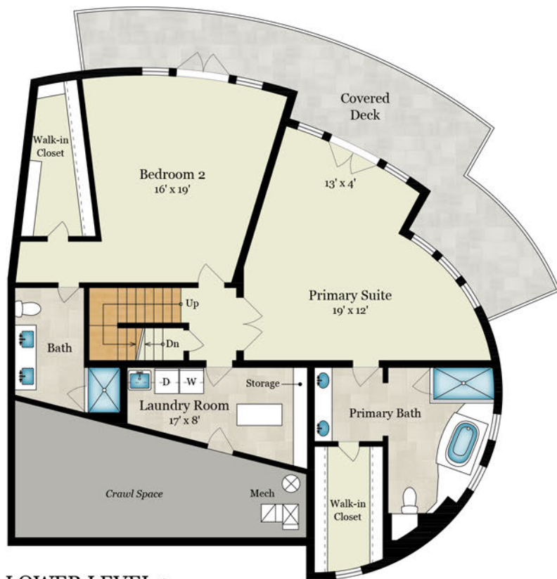
LOWER LEVEL 1 1,460 SQ FT