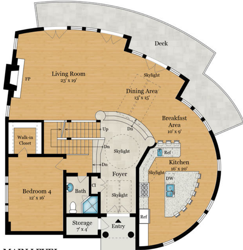
MAIN LEVEL 1,685 SQ FT