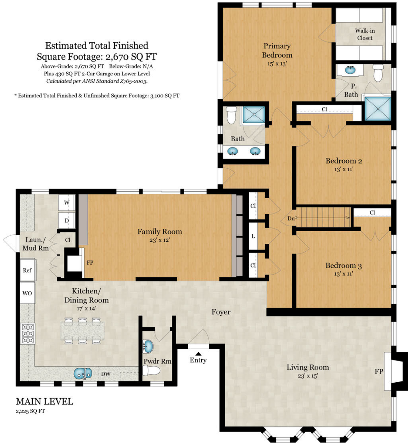
MAIN LEVEL 2,225 SQ FT

* Estimated Total Finished & Unfinished Square Footage: 3,100 SQ FT