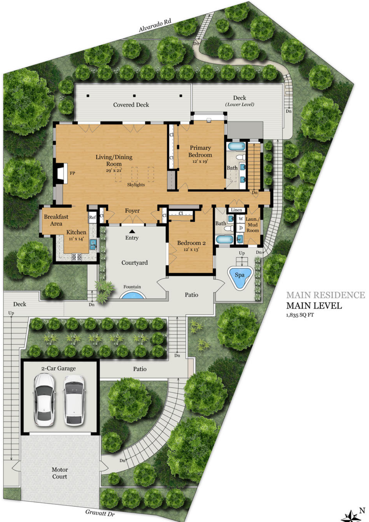
MAIN RESIDENCE MAIN LEVEL 1,835 SQ FT