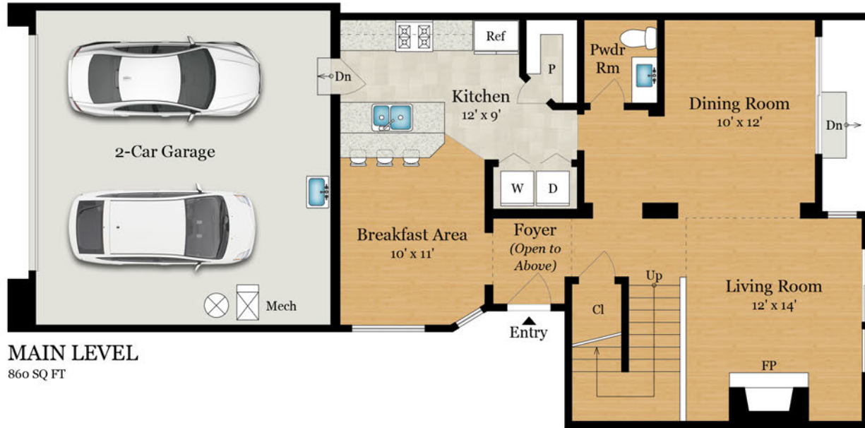
MAIN LEVEL 860 SQ FT