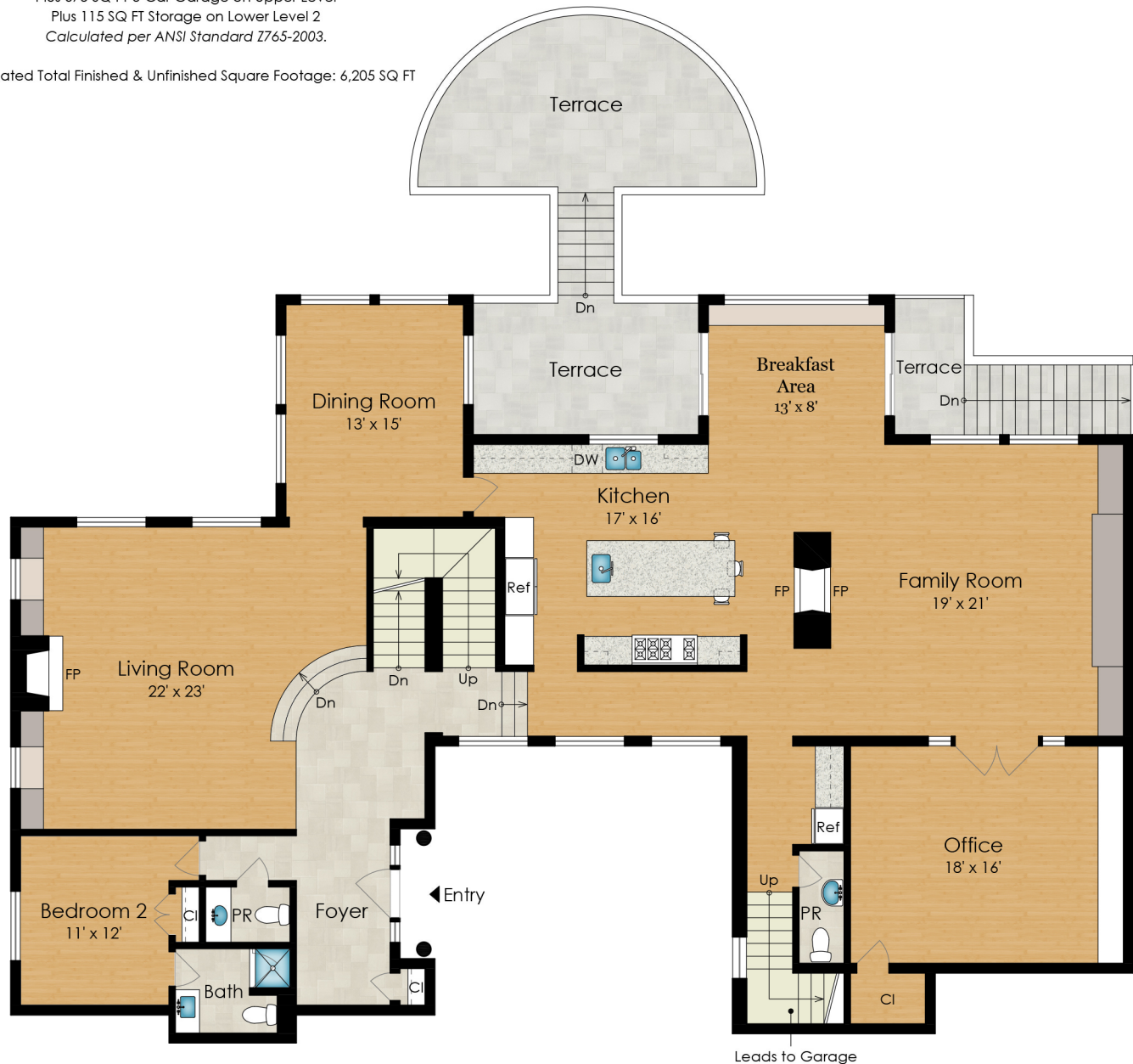
MAIN LEVEL 3,060 SQ FT

* Estimated Total Finished & Unfinished Square Footage: 6,205 SQ FT