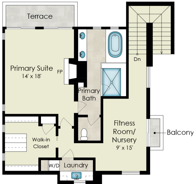
UPPER LEVEL 1,020 SQ FT