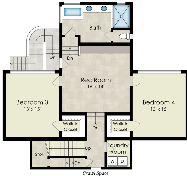
LOWER LEVEL 1 1,185 SQ FT