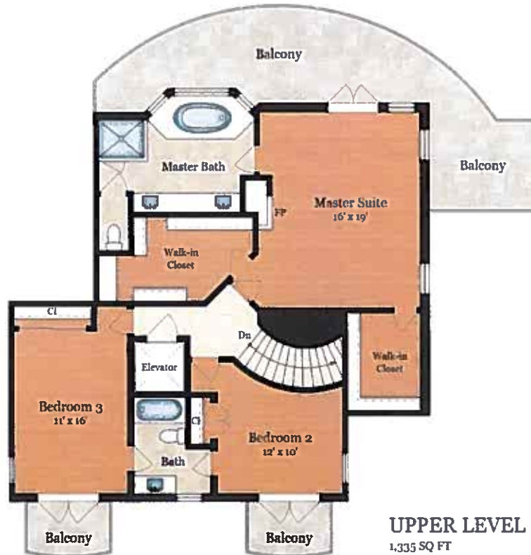
UPPER LEVEL 1,335 SQ FT