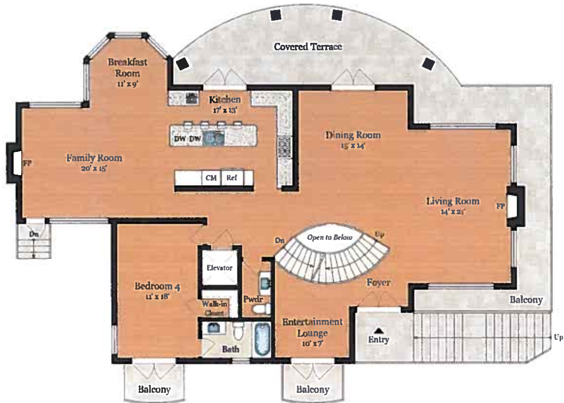
MAIN LEVEL 2,030 SQ FT