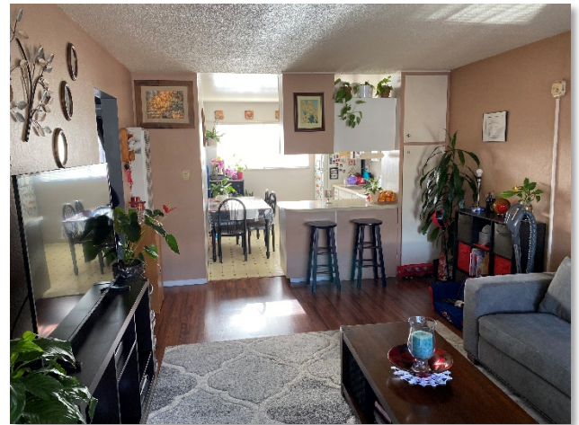
Typical Living Room