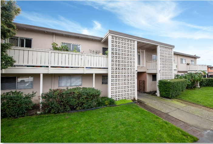
Canal Street Frontage

509 Canal Street – San Rafael 28 Units - $7,000,000