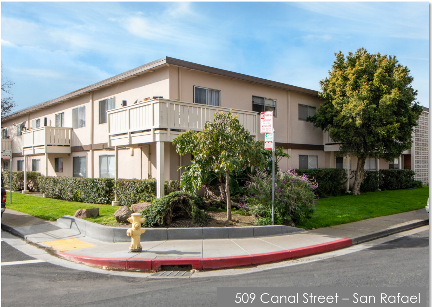
509 Canal Street – San Rafael 28 Units - $7,000,000

The Harbor View Apartments are a 28-unit complex in the "Canal" area of San Rafael. There are 3-3BR apartments and 25-2BR units. Overall the building is in average condition and in need of remodeling and upgrading. Current rents are significantly below market rates. 13 of the units have restricted low rents.