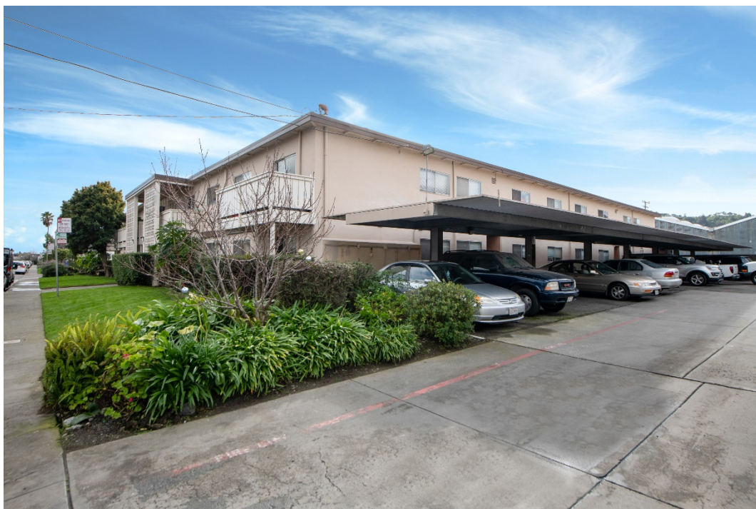
Right Corner Exterior