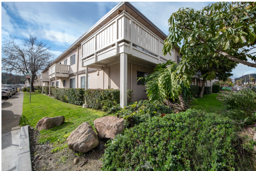
Left Corner Exterior

509 Canal Street – San Rafael 28 Units - $7,000,000