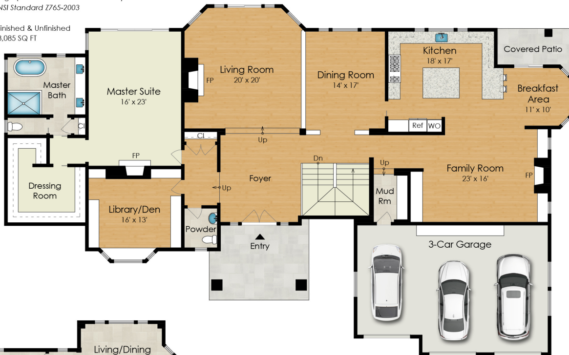
MAIN RESIDENCE MAIN LEVEL 3,155 SQ FT