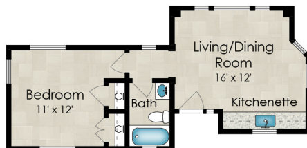
GUEST HOUSE 475 SQ FT