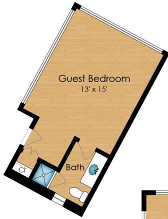
GUEST HOUSE 315 SQ FT

* Estimated Total Finished & Unfinished Square Footage: 4,215 SQ FT