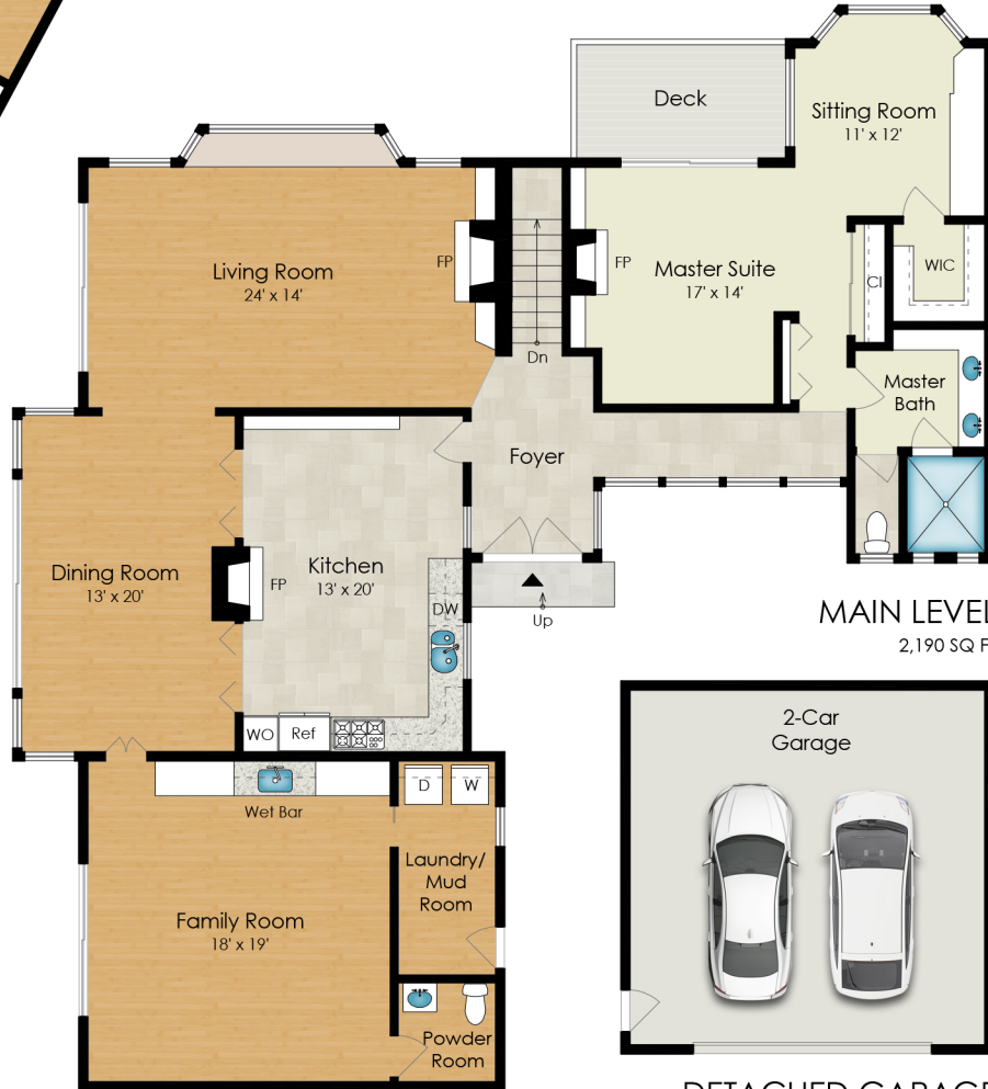
MAIN LEVEL 2,190 SQ FT