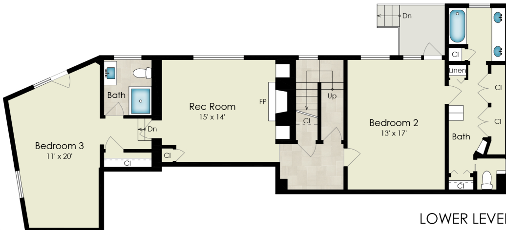
LOWER LEVEL 1,225 SQ FT