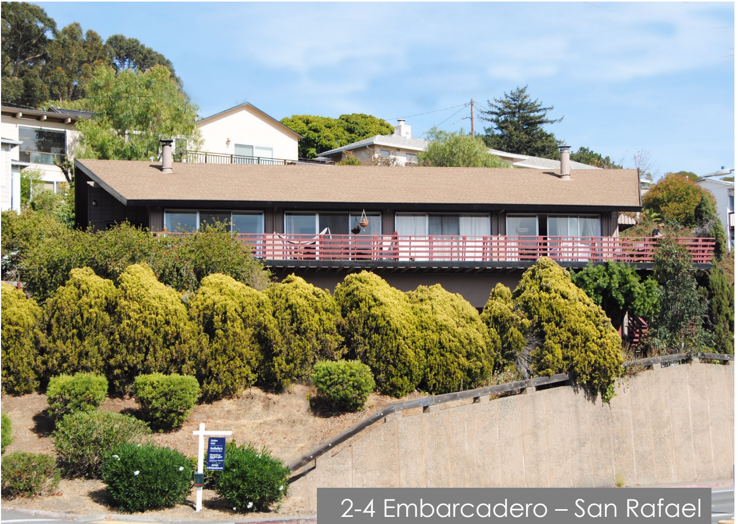
2-4 Embarcadero – San Rafael Duplex - $1,099,000

Side by side 2BR/1.5BA plus den, view duplex. No one above or below you. Close to shopping, restaurants, and transportation.