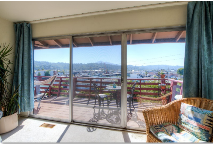
#4 Living Room View