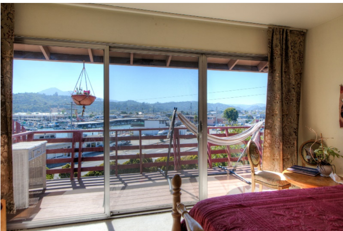
#4 Bedroom View