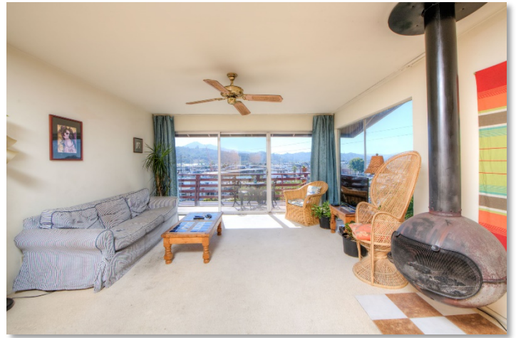
#4 Living Room