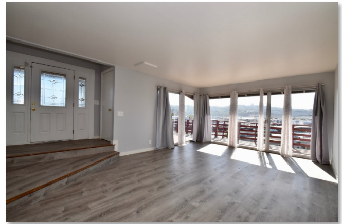
#2 Living Room