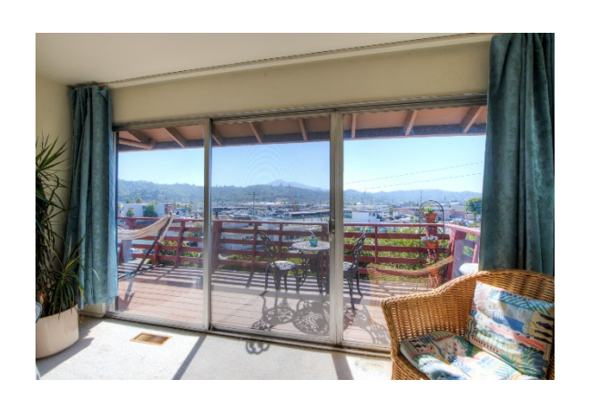
2-4Embarcadero.com Updated 07/15/19 • MLS #21906370

Side by side 2BR/1.5BA plus den, view duplex. No one above or below you. Close to shopping, restaurants and transportation.