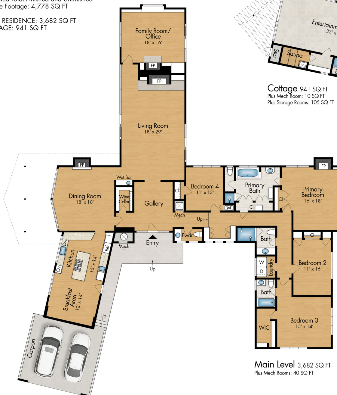
Main Level 3,682 SQ FT Plus Mech Rooms: 40 SQ FT