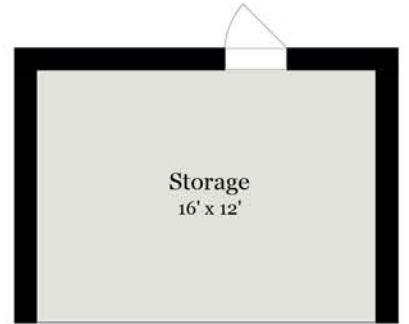
LOWER LEVEL (UNDER LIVING ROOM) 235 SQ FT - Unfinished