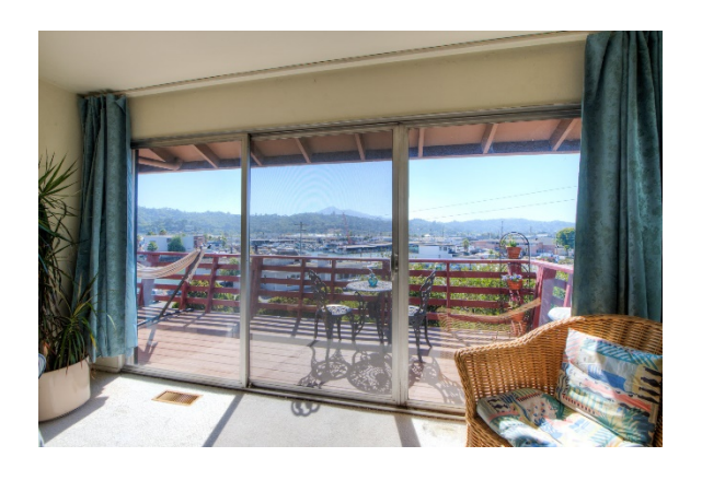
2-4Embarcadero.com Updated 10/15/18 • MLS #21824395

Side by side 2BR/1.5BA plus den, view duplex. No one above or below you. Close to shopping, restaurants and transportation.