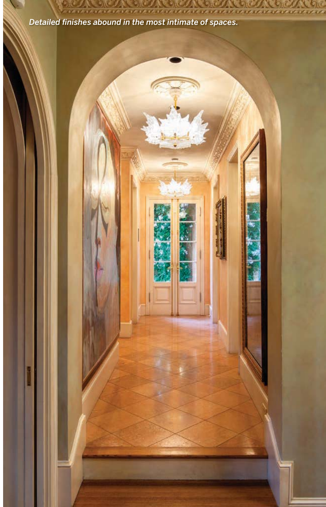
Detailed finishes abound in the most intimate of spaces.