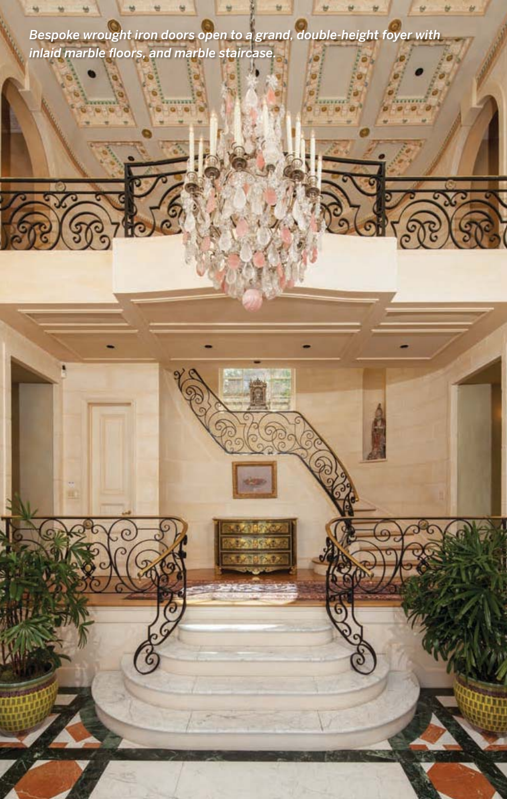
Bespoke wrought iron doors open to a grand, double-height foyer with inlaid marble floors, and marble staircase.